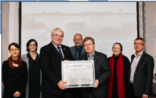
26/10/17: University of Cologne, new CG member